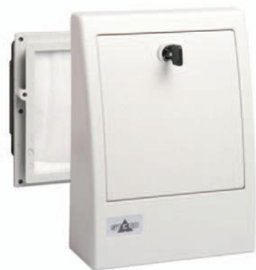
Outdoor filter fan