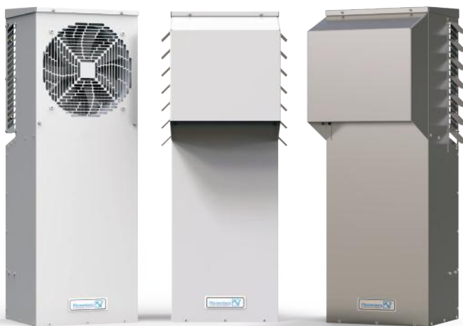
PKS 3301 Indoor Rated