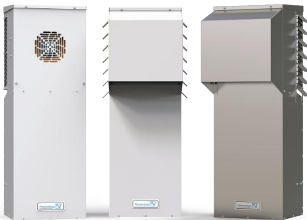
PKS 3131 Indoor Rated