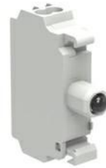
LED elements steady light with spring-clamp terminals LPXLP