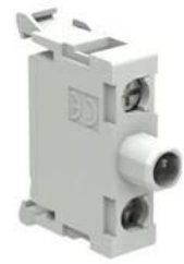
LED elements steady light base mount on LPZ control station LPXLPB