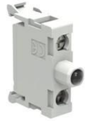
LED elements steady light base mount on LPZ control station LPXLPB