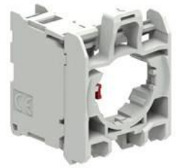
Contact elements - with mountin adapter LPXE