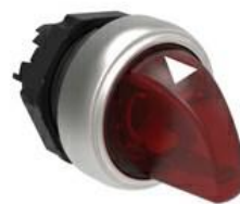
Illuminated selector switch actuator - 3 position LPCSL13