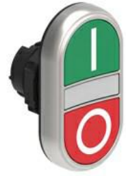
Double-touch actuators, spring return white indicator - Two flush pushbuttons LPCBL71