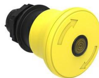
Illuminated mushroom head button actuators - Latch, turn to release Ø 40mm/1.6" LPCBL66