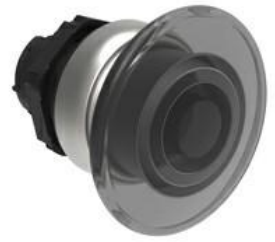
Illuminated mushroom head button actuators - Spring return Ø 40mm/1.6" LPCBL61