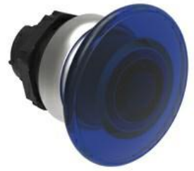
Illuminated mushroom head button actuators - Spring return Ø 40mm/1.6" LPCBL61