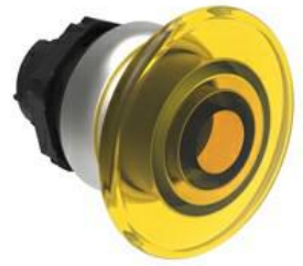
Illuminated mushroom head button actuators - Spring return Ø 40mm/1.6" LPCBL61