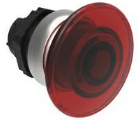
Illuminated mushroom head button actuators - Spring return Ø 40mm/1.6" LPCBL61