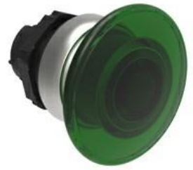
Illuminated mushroom head button actuators - Spring return Ø 40mm/1.6" LPCBL61