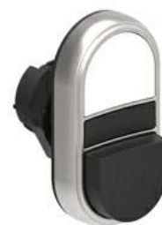
Double-touch actuators, spring return - One extended and one flush pushbuttons LPCB72