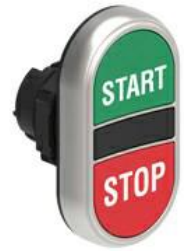
Double-touch actuators, spring return - two flush pushbuttons LPCB71