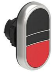
Double-touch actuators, spring return - two flush pushbuttons LPCB71