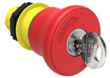
Mushroom head pushbutton, Latch, turn key to release diam 40mm/1.6" LPCB684