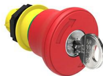
Mushroom head pushbutton, Latch, turn key to release diam 40mm/1.6" LPCB684