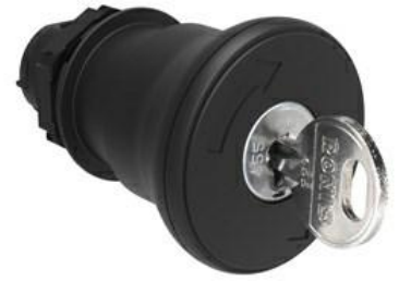
Mushroom head pushbutton, Latch, turn key to release diam 40mm/1.6" LPCB684