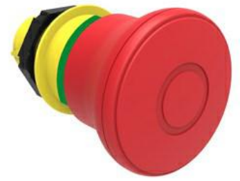
Mushroom head pushbutton, Latch, pull to release diam 40mm/1.6" LPCB674