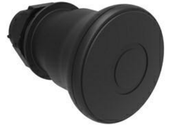
Mushroom head pushbutton, Latch, pull to release diam 40mm/1.6" LPCB674