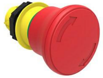
Mushroom head pushbutton, Latch, turn to release diam 40mm/1.6" LPCB664