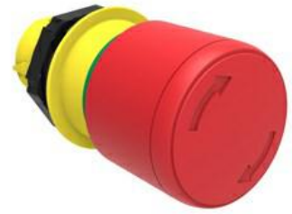
Mushroom head pushbutton, Latch, turn to release diam 30mm/1.2" LPCB663