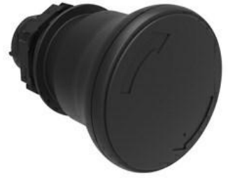
Mushroom head pushbutton, Latch, turn to release diam 40mm/1.6" LPCB634