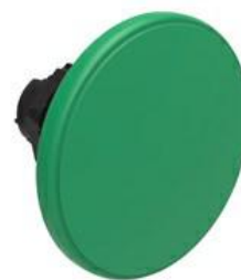
Mushroom head pushbutton, spring return diam 60mm/2.4" LPCB616