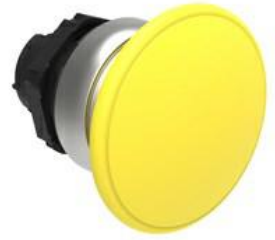
Mushroom head pushbutton, spring return diam 40mm/1.6" LPCB614