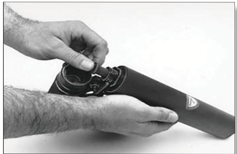
Loading the Driver

The gold probe has a 56% greater cross-sectional area than the silver; it is recommended for light weight concrete - less than 125 lbs/cu. ft. (2003 Kg/M3) in density. The silver probe is used with concrete having a density greater than 125 lbs/cu. ft. (2003 Kg/M3).