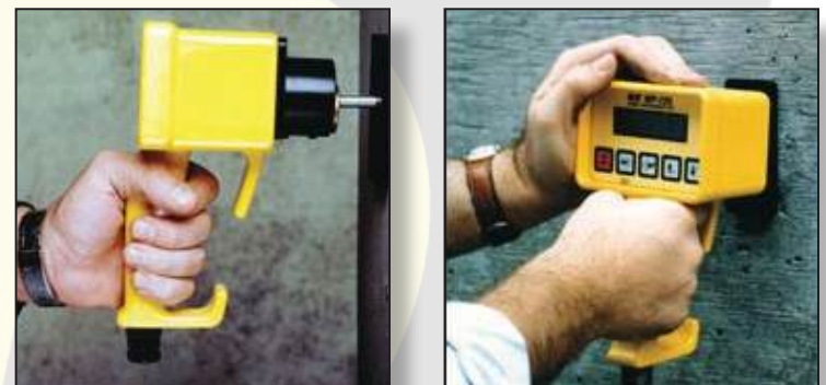
Using the Windsor Probe Measuring Unit

Probes Available in Sets of 3 or Case of 75, Gold or Silver