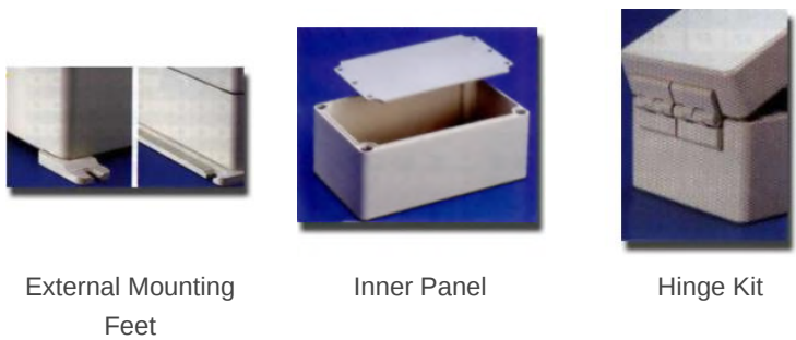
External Mounting Feet