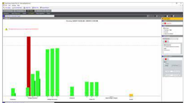
Fluke Energy Analyze Plus: Power quality health summary