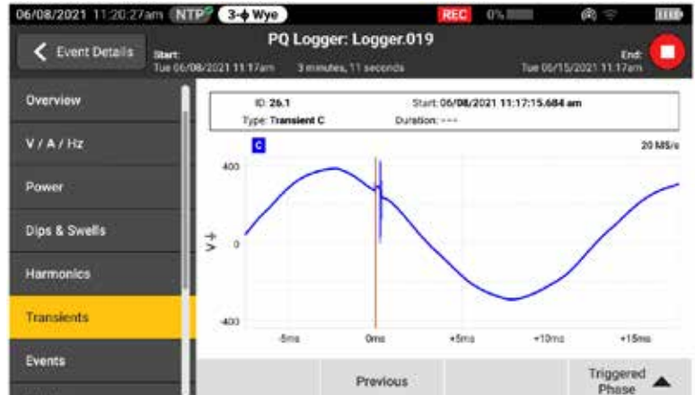
View real-time voltage transitory events while logging for faster troubleshooting

Transients negatively impact otherwise healthy systems every day and their potential to damage your equipment can't be underestimated. Whether your system is experiencing impulsive or oscillatory transients, the results can be devastating and cause problems ranging from insulation failures to total equipment failures. The Fluke 1775 and Fluke 1777 incorporate advanced transient capture technology to help you clearly identify high-speed voltage transients, so you have the data you need to stop them in their tracks. The Fluke 1775 Power Quality Analyzer has 1MHz sampling capability to capture fast transients, while the Fluke 1777 Power Quality Analyzer has 20MHz sampling capability to capture the fastest transients in high detail.