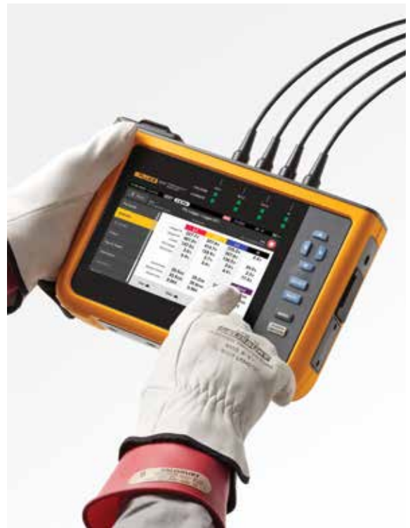
Easily navigate using the large color touchscreen

When downloading data from the Fluke 1770 Series Power Quality Analyzers the included Energy Analyze Plus software package can compare measured voltage and current harmonic statistical data to different standards, like EN 50160 or IEEE 519, to determine if they exceed compliance limits. This powerful predictive maintenance feature enables current harmonics to be observed before distortion appears in the voltage allowing you to prevent unexpected failures or non-compliance situations and increase system uptime. With the proliferation of inverter-based loads and power generation, keeping current harmonics in check is becoming increasingly critical to ensure reliable power quality and avoid system downtime.