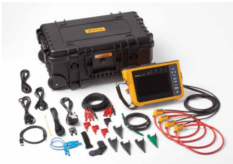
Fluke 1777 Power Quality Analyzer. Note: Included items vary by model and are listed in the “Ordering information” table.