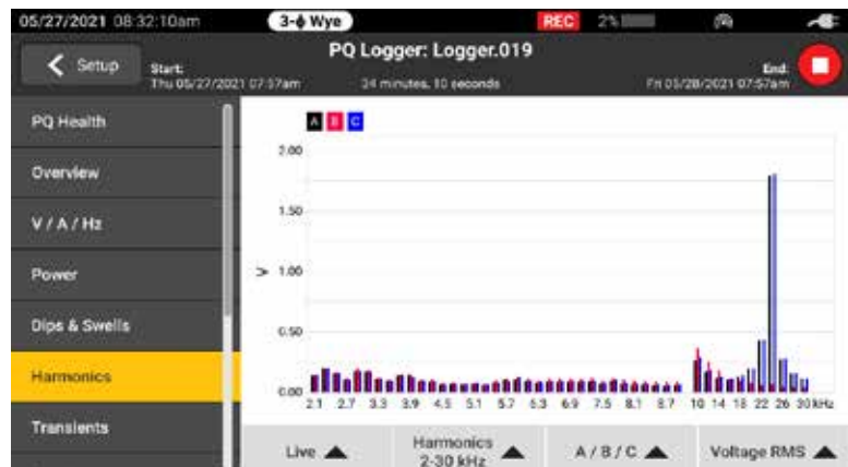
A full range of harmonics are available from the first 50 integer harmonics and from 2 kHz to 30 kHz

The Fluke 1770 Series was designed to be safe and easy to use in any measurement environment. The 1770 Series allows you to capture a full range of power quality variables as well as high-speed waveforms, high-speed transients, and higher frequency harmonics, all of which are instantly viewable on the large, high-resolution screen. With a best-in-class CAT IV 600 V / CAT III 1000 V overvoltage rating, these analyzers can be used at the service entrance or downstream, measuring AC and DC inputs, and harmonics measuring up to 30 kHz. With the 1770 Series you can be confident that you'll capture the data you need to make better maintenance decisions no matter the task.