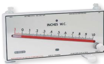
Mark II Model No. 40-1 inclined manometer