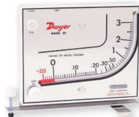
Mark II Model No. 25 inclined-vertical manometer. (shown with optional A-612 portable stand)

3% Accuracy For Stationary And Portable Applications