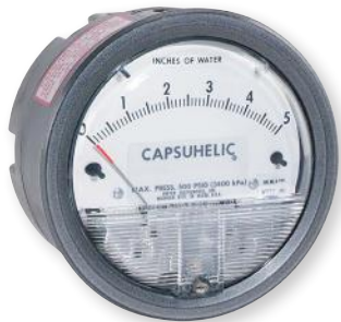
Capsuhelic® Pressure Gage has a large, easy-to-read 4" (102 mm) dial.