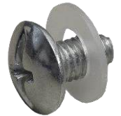
Mounting Screw with Nylon Washer

Secure Power/Fan module to enclosure using supplied hardware. To ensure proper seal, use the nylon washers included with hardware.