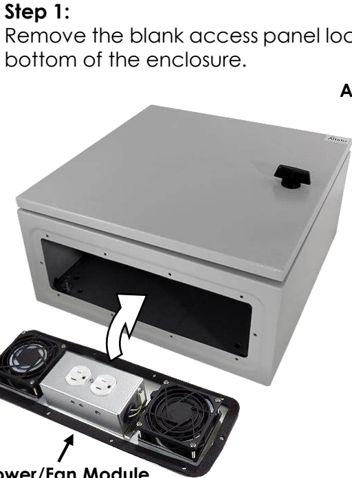
Power/Fan Module with Gasket