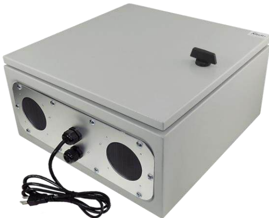
Enclosure with Power/Fan Module Installed