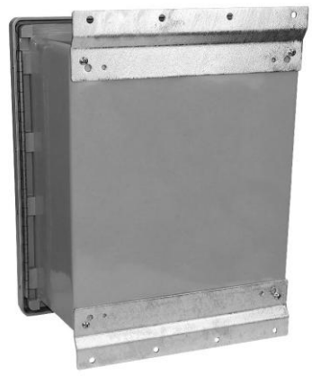
Flange Mount Kit

Got Questions? We are here to help. Contact us at: