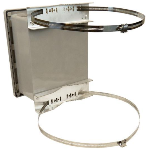
Pole Mount Kit

These kits easily attach to the rear of the enclosure. The mounting bracket features multiple locations to thread the stainless steel bands so that small to large poles can be accommodated. These kits can be used for pole sizes ranging from 2" to 17.5" in diameter.